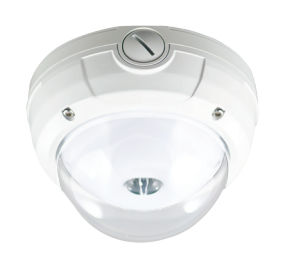
EL-DE Weatherproof Luminaire Enclosure^