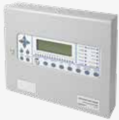
LAAP-S-1 Addressable Control Panel