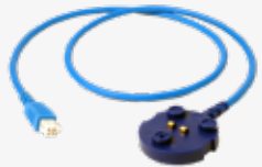
LA-WLDP LEAKalarm Detection Probe