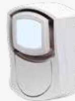
HSVS Alarm Activated Voice Sounder