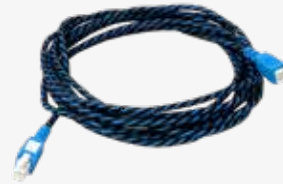
LAW-10 LEAKalarm Wire 10m/5m