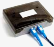
LA-WLDM Addressable Interface Module