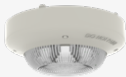
CHQ-ARI Loop Powered Remote Indicator